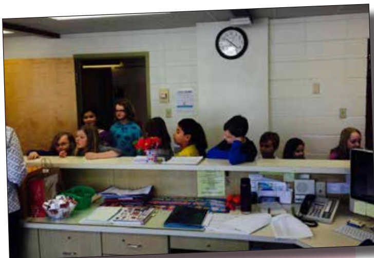
In honor of the 100th day of school on Feb. 3, Coolidge Elementary students reported 100 acts of kindness observed in other students and displayed them in "candy messages" in the main hallway.

Following the event, teachers and students reflected on their experience and what they learned from a day of unstructured play.