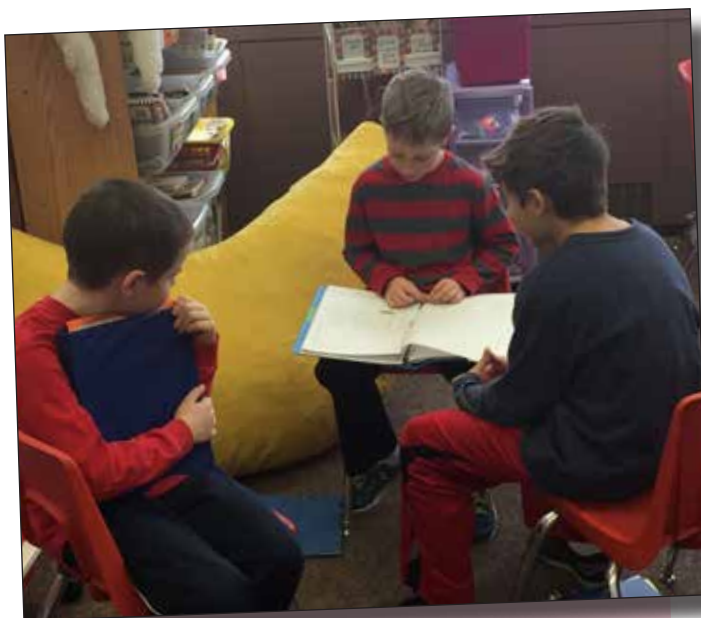
Lakeview Elementary students shared their best writing of the year with fellow students as part of the Lakeview Writing Celebration. Students in all grades split into different classrooms and read their best writing samples from the past year to each other.