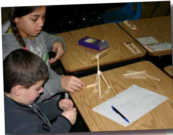
Hoover Elementary students recently participated in a STEM Day. Neenah High School students coordinated the activities, which provided hands-on problem solving skills, engineering design process and teamwork in seven different stations throughout the day.

The show is based on the 1989 Disney movie and a classic story by Hans Christian Andersen about a mermaid who dreams of the world above the sea and gives up her voice to find love.